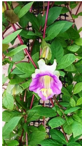
Cup and Saucer